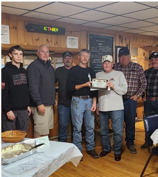
A few pictures from the Summer League banquet